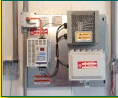
VFD Controls for variable speed operation