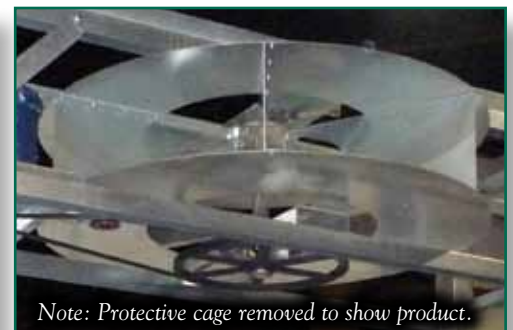
Note: Protective cage removed to show product.